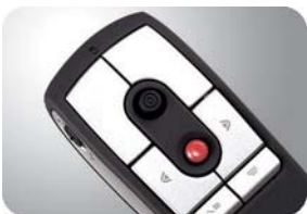
All of the buttons are conveniently placed