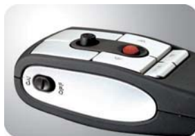
Power on /off switch