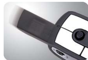
Receiver into the back